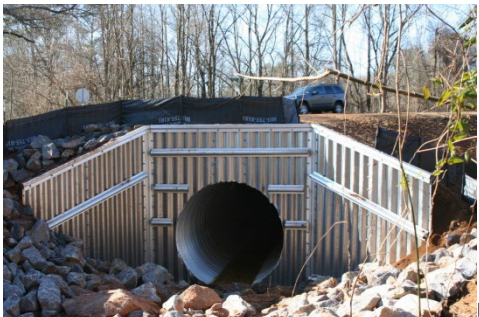
Use Pipe Wingwall